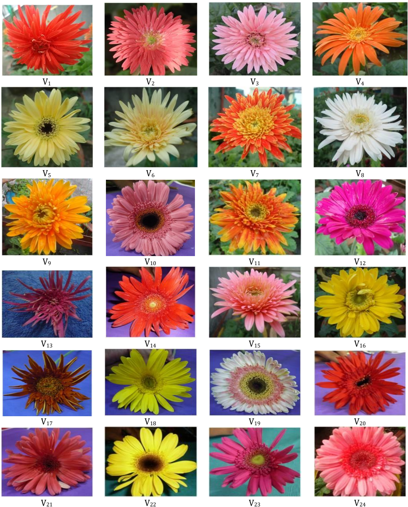
Figure 02. Gerbera cultivars